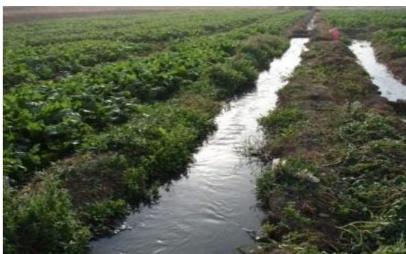
Fig. 5. Vast Farms for Uncooked Vegetable.