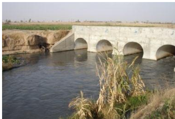
Fig. 2. Main Canal of the Sewage Water with Lifting Diesel Pumps.