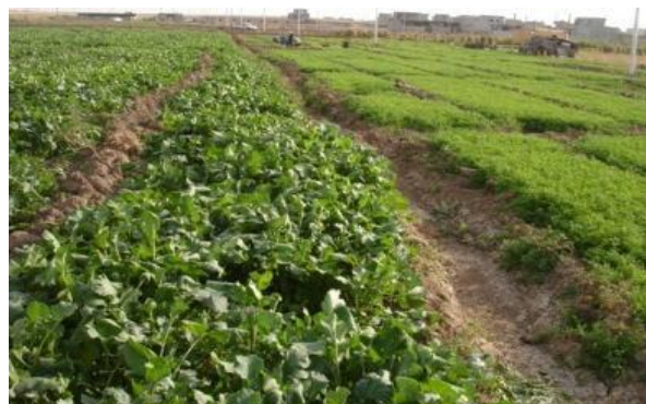
Fig. 4. Vast Farms for Uncooked Vegetable.