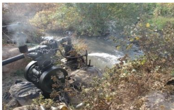
Fig. 3. Main Canal of the Sewage Water with Lifting Diesel Pumps.